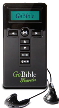
Travel version ... Full Bible , with some added features of the original version not available.