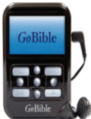
The Original GoBible